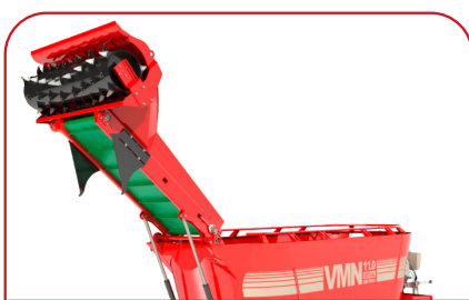
Option with self-loading arm