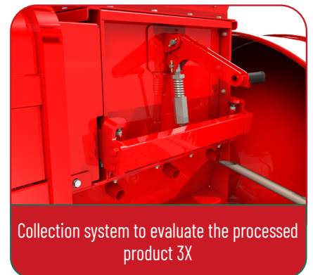
Collection system to evaluate the processed product 3X