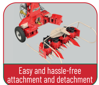
Easy and hassle-free attachment and detachment