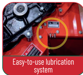
Easy-to-use lubrication system