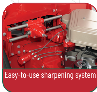
Easy-to-use sharpening system