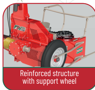
Reinforced structure with support wheel