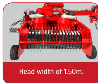
Head width of 1.50m.