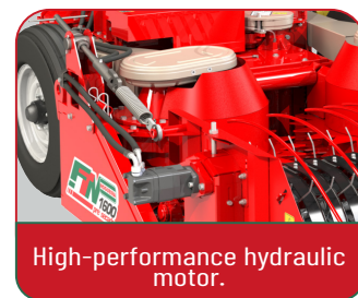
High-performance hydraulic motor.