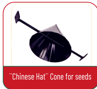
"Chinese Hat" Cone for seeds