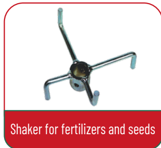
Shaker for fertilizers and seeds