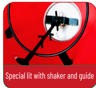
Special lit with shaker and guide