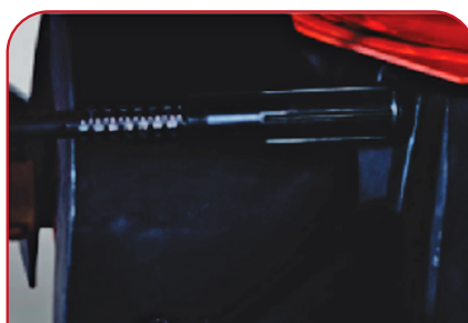
Simplified output regulation