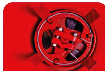
Shaker with oscillating system