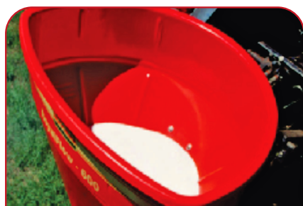
Royal Flow in action in the field