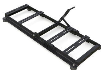
Mount sold separately