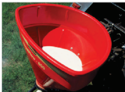
Royal Flow in action in the field