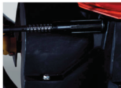
Simplified output regulation