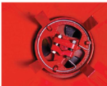
Shaker with oscillating system