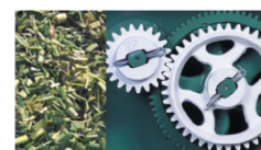
22 mm (optional)