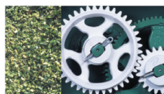
6 mm (optional)